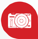
Mirrorless Camera (EOS M, EOS R)