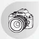
EOS DSLR Camera