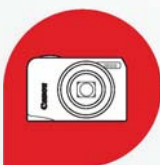
Compact Digital Camera