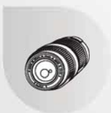
EF, EF-S, EF-M, RF Lenses